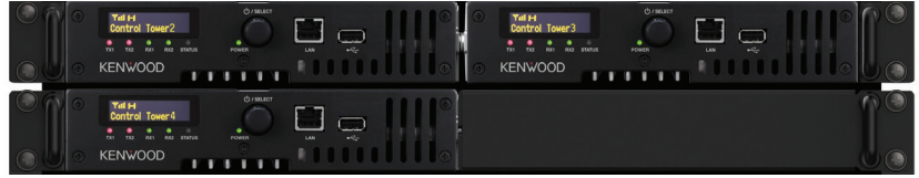
Example of rack mount options.